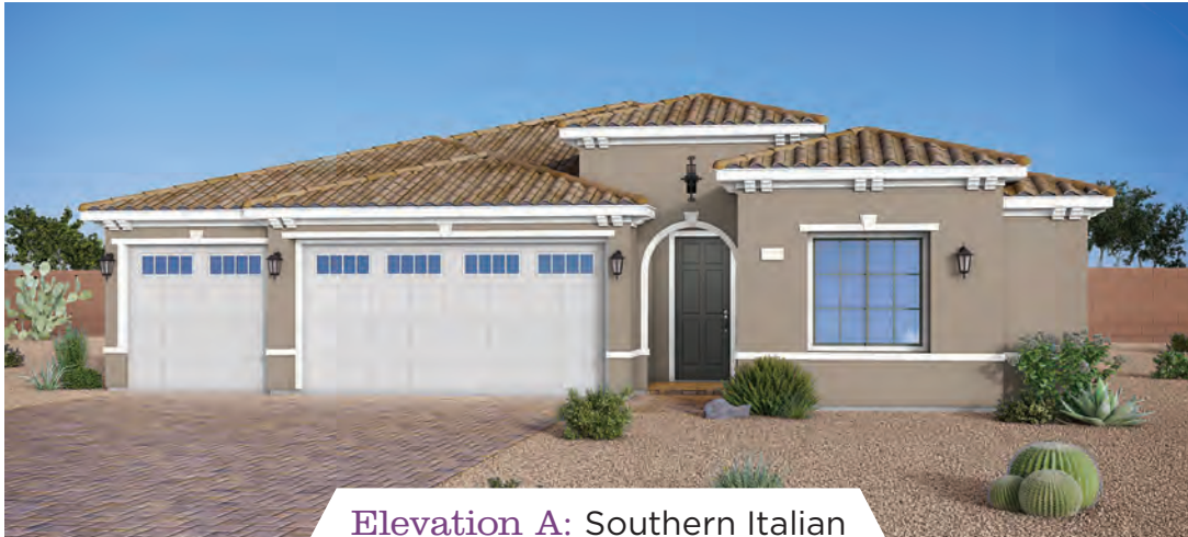
Elevation A: Southern Italian

3 BEDS | 2.5 BATHS | 3-BAY GARAGE | 2,223 SQ FT