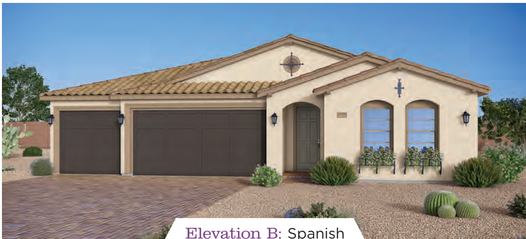
Elevation B: Spanish