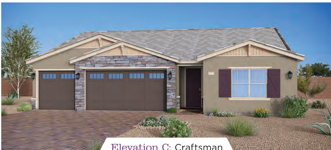
Elevation C: Craftsman