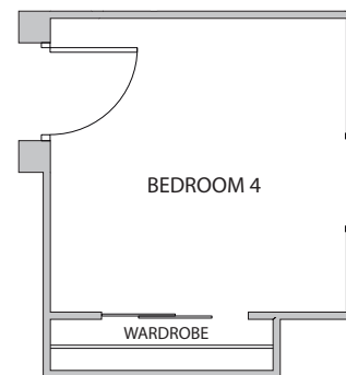
BEDROOM 4 ILO DEN