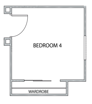
BEDROOM 4 ILO DEN