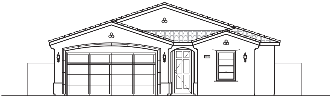
Elevation B: Spanish