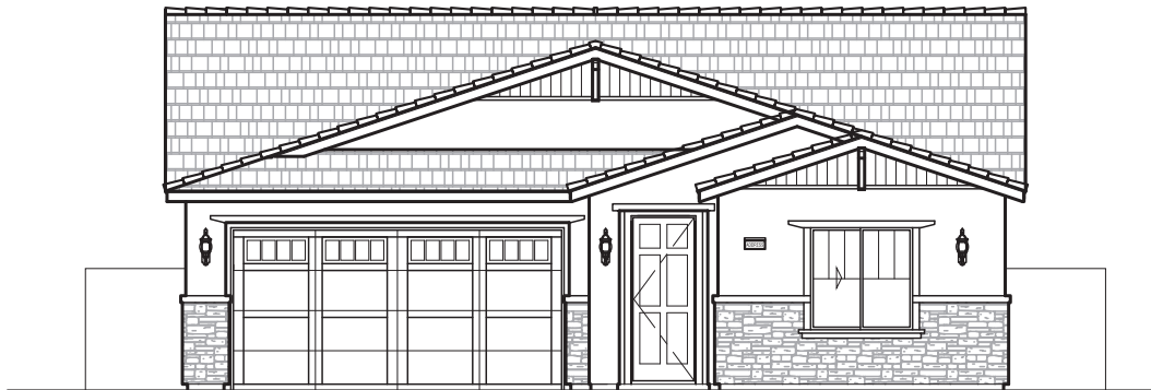
Elevation C: Craftsman