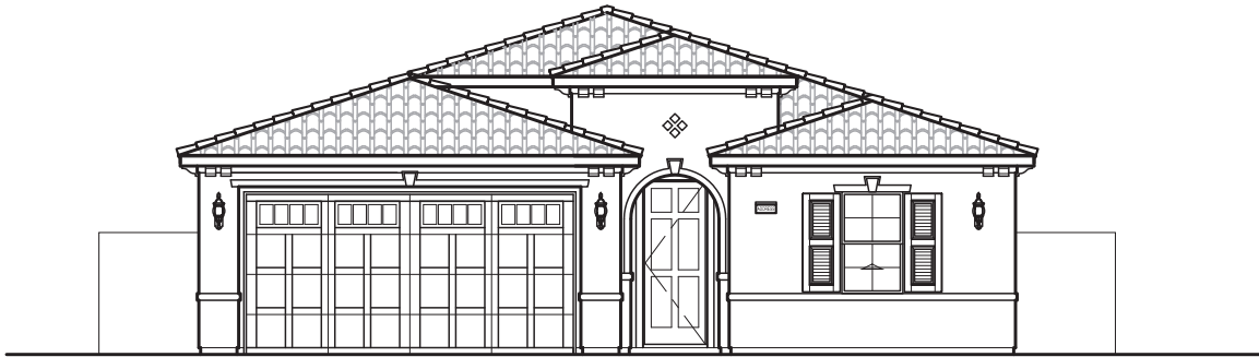
Elevation A: Southern Italian

3 BEDS | 2 BATHS | 2-BAY GARAGE | 1,935 SQ FT