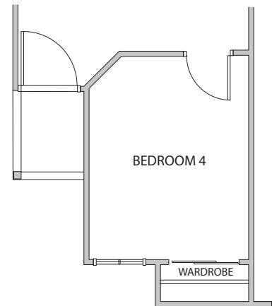
BEDROOM 4 ILO DEN